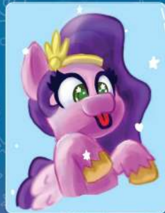
Pipp by Glens Launcher