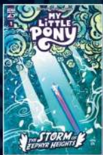
Cover A Art by Juni Ba