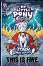
Cover B Art by Andy Price