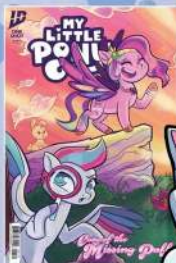
Cover B Art by Sophie Scraggs