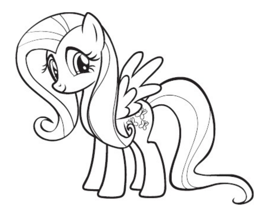
The Warm, Fuzzy Truth