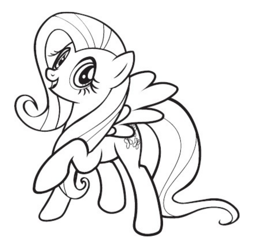
The Fine Furry Friends Fair