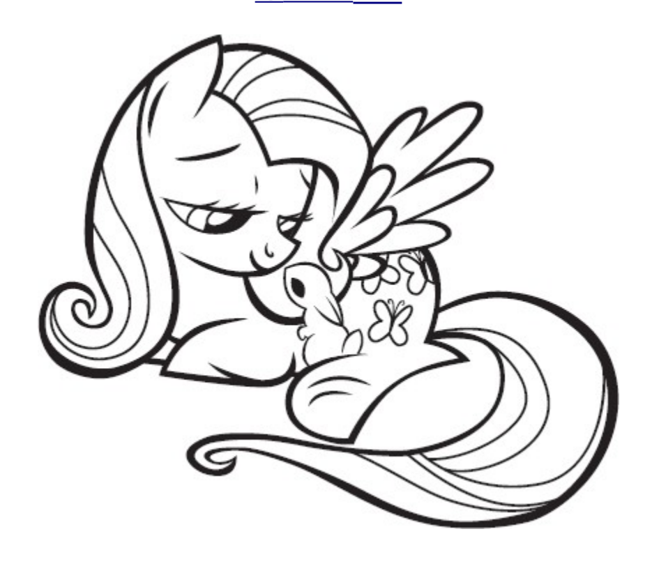
Trials and Errors