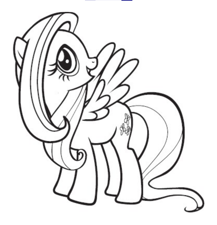
Ewe Can Do It, Fluttershy!