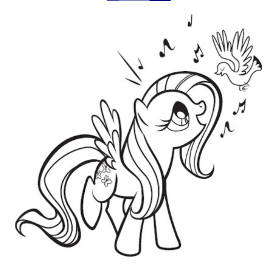
Alone at the Fair