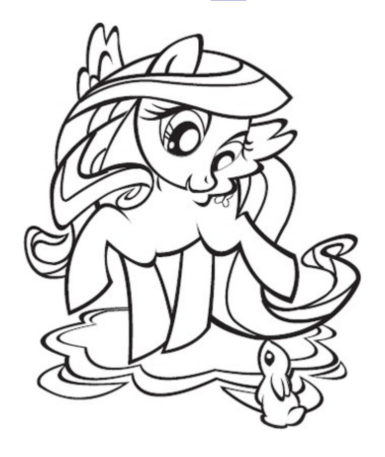
Singing a Different Tune